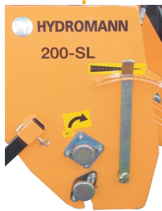
Adjustment of spring base