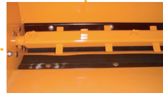
Agitator over roller