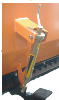
Adjustment of spring base with emptying function