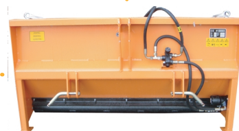
3-point hitch and hydraulic flow regulator