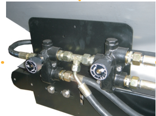
Manual adjustment of spread width and dosing.