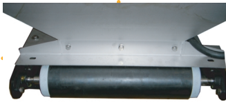
Rubber transport belt.